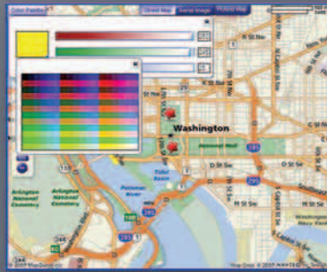
Sample Controls, Color Palette