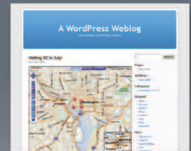
Use of a Map in a Blog