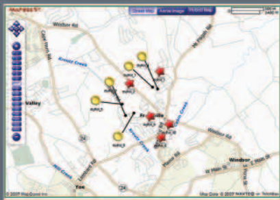
Advanced Map Marker, Declutter