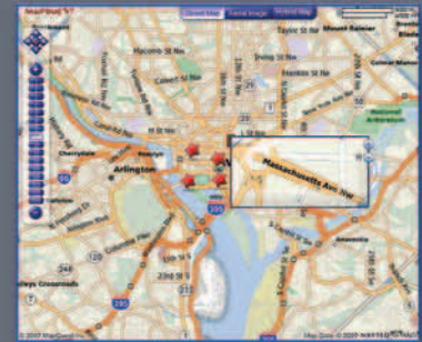
Sample Controls, Magnify